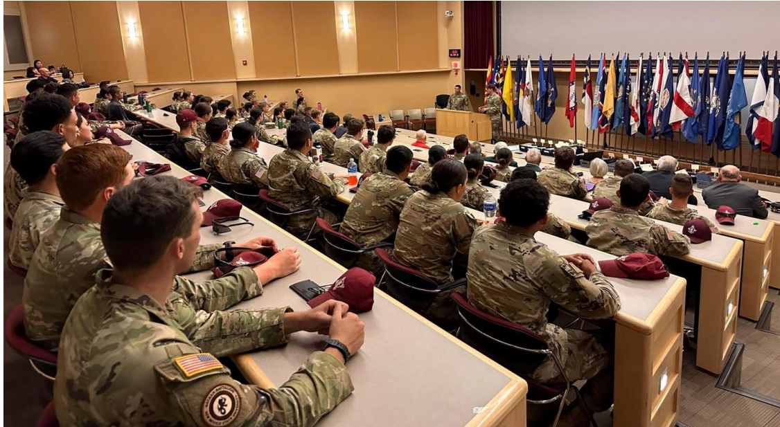
SPRING 2023 AWARD CEREMONY POST ANNUAL PASS IN REVIEW.