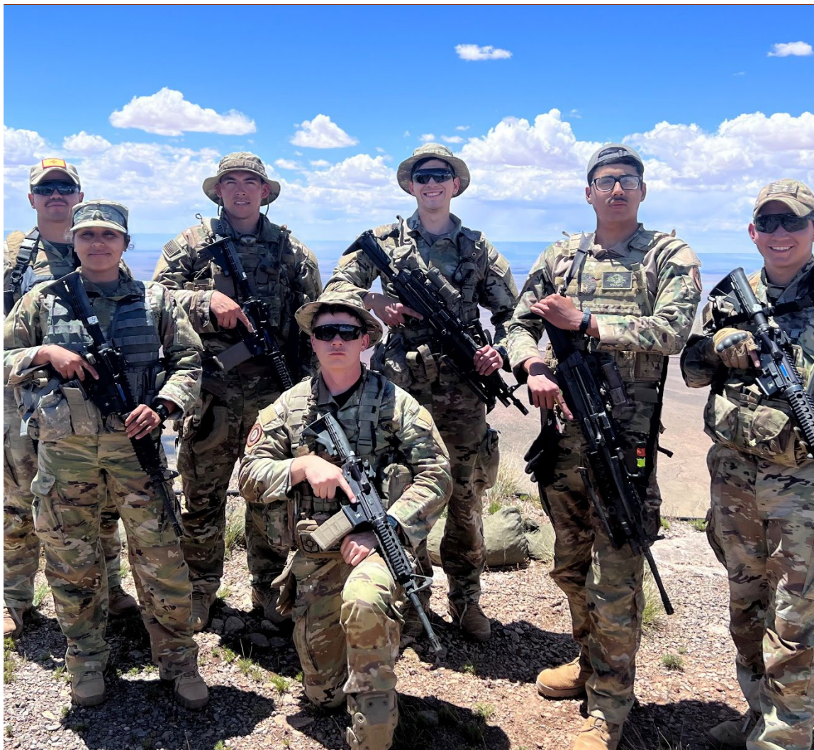
New Mexico National Guard - Cadet Training Company (CTC) made up of SMP Cadets from the NMSU Army ROTC program.